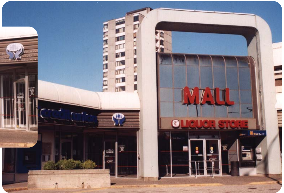
The exterior of our new branch in the Royal Square Mall at 25B-800 McBride Boulevard in New Westminster.